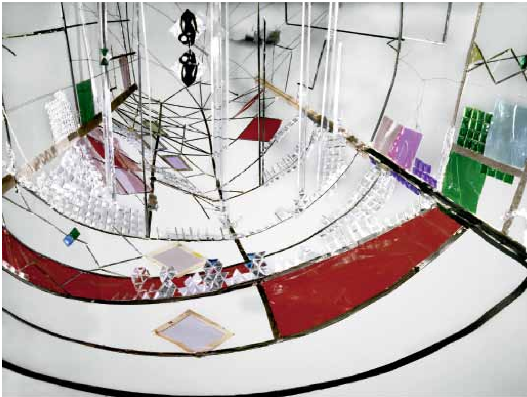
By a Thread , 2009 C-type print 30 x 40 cm

YN: Translation is central to my work and process. For me, translation is about the broad strokes of an original idea that serves to shift and reconstruct meaning through language. The photographs are sites of translation. The source photograph is reconstructed as a sculptural form but through broad strokes – I like the distillation. The sculptures are more suggestive of a space and moment, rather than a literal articulation. They are spaces in transition or in states of becoming. The final work ends up quite a distance away from its origin and the tension between what is intended and realized lies in this gap.