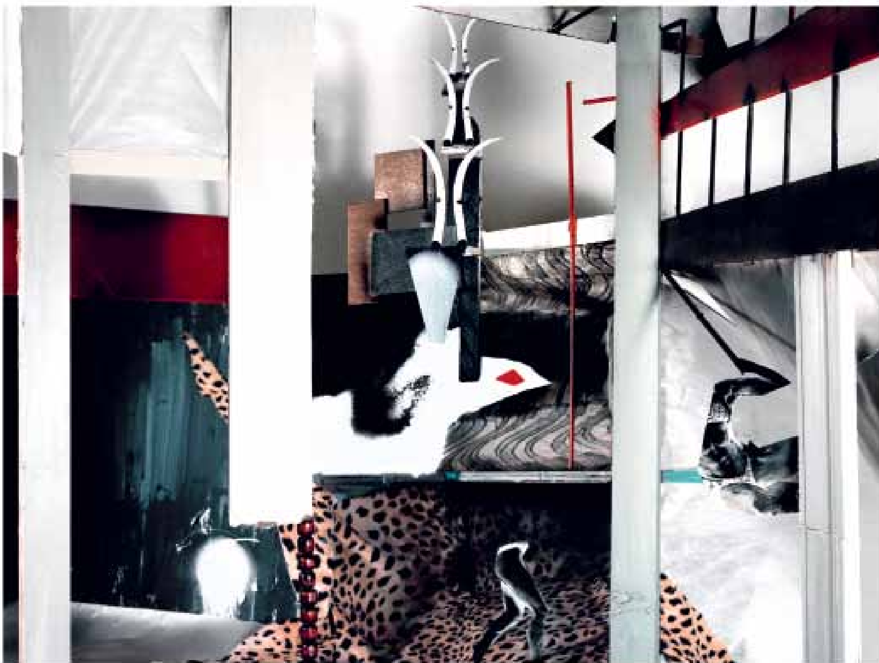
Pursuit , 2010 C-type print 91.4 x 121.9 cm