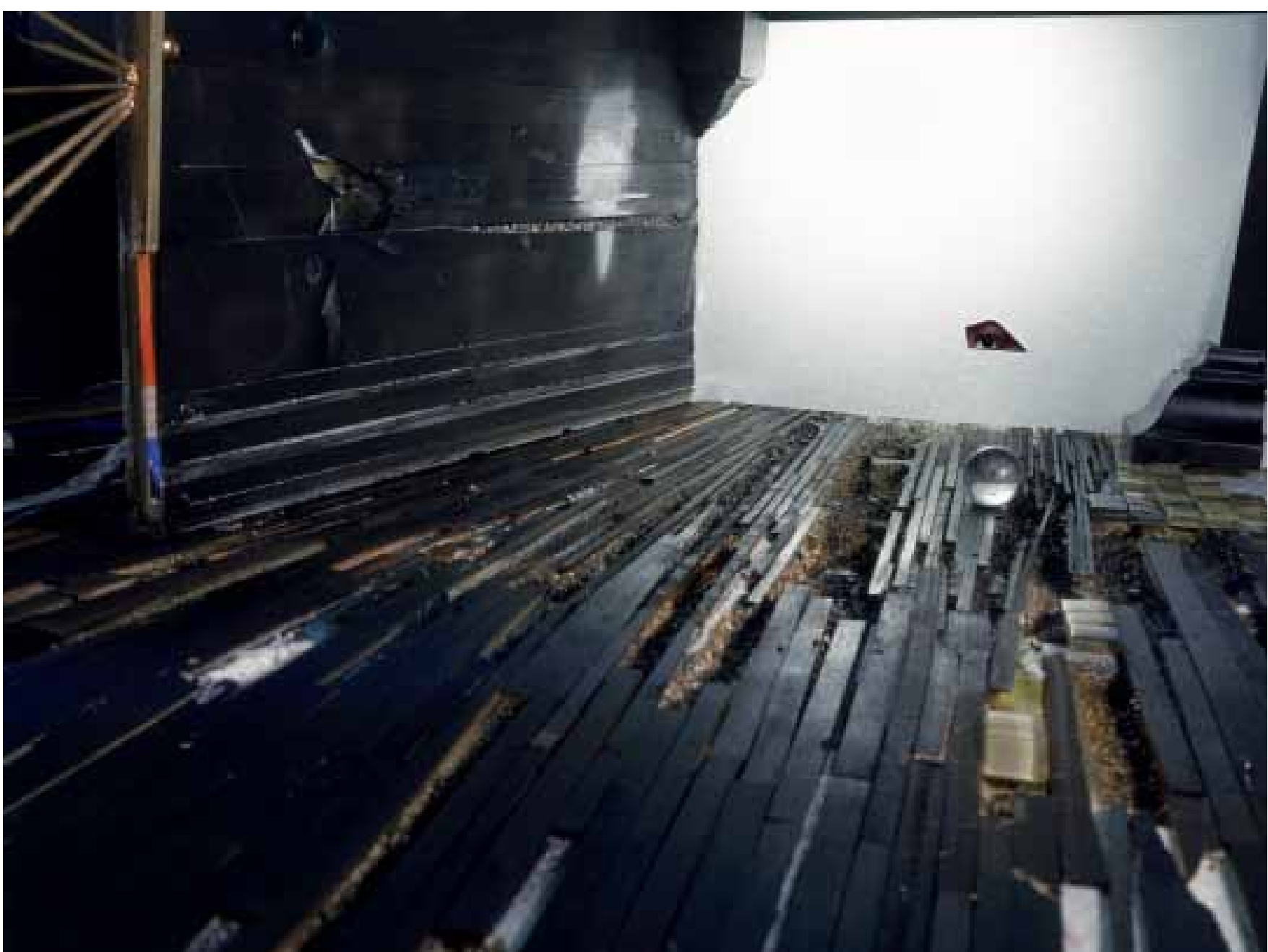
Cleo , 2009 C-type print 76 x 101 cm