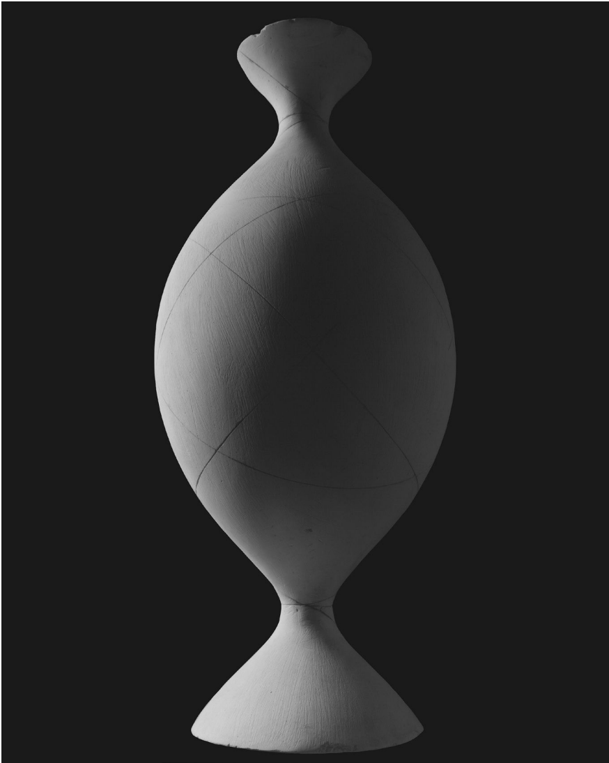
(left) Hiroshi Sugimoto (Japan, b. 1948), Mathematical Form 0004 ( Onduloid: A Surface of Revolution with Constant Non-Zero Mean Curvature ), 2004. Cincinnati Art Museum Permanent Collection. Acquired with The Edwin and Virginia Irwin Memorial Fund. © Hiroshi Sugimoto. All rights reserved. Courtesy Fraenkel Gallery, San Francisco.