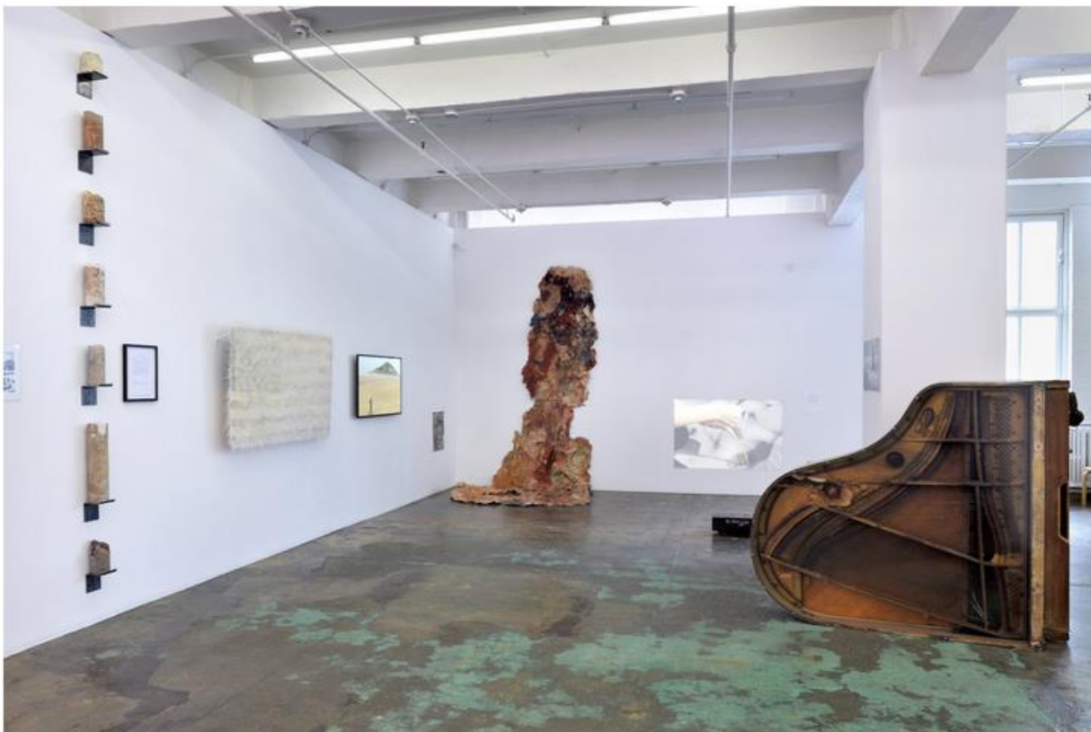
Installation view of ecofeminism(s) at Thomas Erben Gallery, New York

ecofeminism(s) , a group show at Thomas Erben Gallery, is aptly titled. Lowercase and implicitly plural, the name nods to ecofeminism's defining heterogeneity, its status as more of a broad coalition or affinity than a cohesive movement. Ecofeminism's unifying tenet is that the exploitation of nature and the exploitation of women are interconnected under a patriarchal framework of ownership, domination, and self-interest. However, ecofeminists have historically differed as to whether women's connection to the environment skews more biological or more social. The general preponderance of one view over another trends chronological;