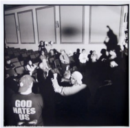
Elaine Stocki, "Albert" 2013. Hand-tinted silver gelatin print, edition of 5 (+2 AP), 29.75 x 30 in. Courtesy the artist and Thomas Erben Gallery, New York // Elaine Stocki, "Ellice" 2013. Silver gelatin print, edition of 5 (+2 AP), 29.25 x 29.25 in. Courtesy the artist and Thomas Erben Gallery, New York