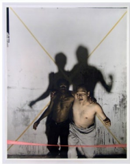
Elaine Stocki, "Return of the Booster" 2014. Hand-tinted silver gelatin print, edition of 5 (+2 AP), 39 x 31.5 in. Courtesy the artist and Thomas Erben Gallery, New York // Elaine Stocki, "K" 2013. Hand-tinted silver gelatin print, edition of 5 (+2 AP), 38.25 x 30 in. Courtesy the artist and Thomas Erben Gallery, New York.