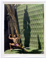
Elaine Stocki, "711" 2014. Hand-tinted silver gelatin print, edition of 5 (+2 AP), 36 x 29 in.