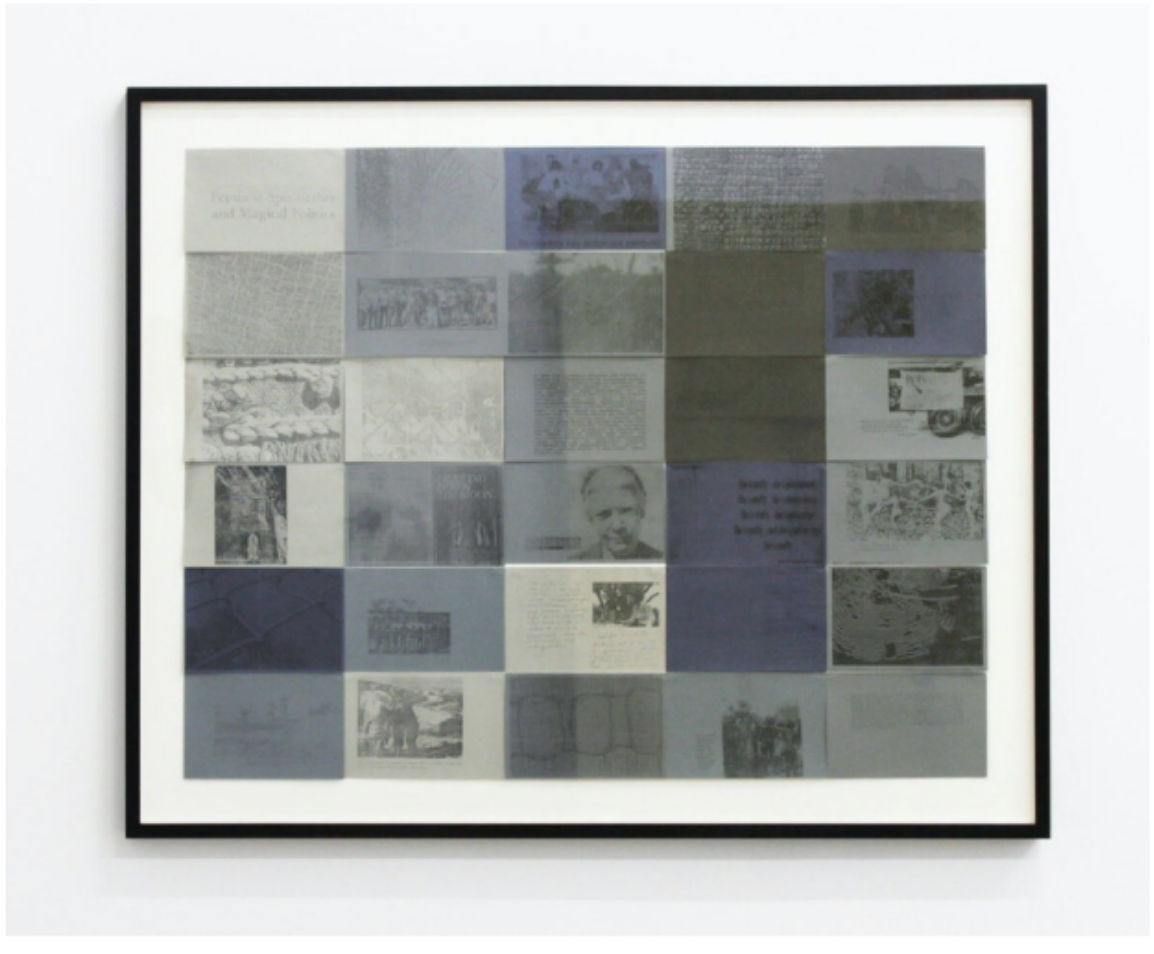
Andrea Bowers, Feminist Spirituality and Magical Politics Scrapbook, 2003. Photocopy on paper, 33 1/4 x 42 3/4 inches.

Environmental activism is often led by people who are oppressed by the entangled politics of gender, race, and class. The logic of domination that modern man applies to land and nonhuman life has simply been more recognizable to those who have been subjected to the same logic. As a critical strategy, ecofeminism has interrogated the connection between the devaluation of women and the devaluation of "nature," which is itself so often gendered female. In ecofeminism(s) , an image by Barbara Kruger shows a woman with leaves covering her eyes, overlaid with a characteristic block-letter slogan that warns of awakening and resistance: Untitled (We Won't Play Nature to Your Culture) (1983).