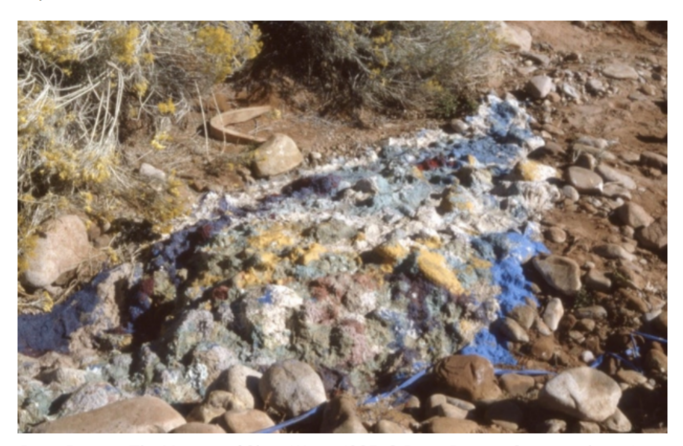
Betsy Damon, The Memory of Clean Water, 1985.

You could say it is a terrible time to open a gallery show. New York City languishes in an ongoing lockdown to contain the coronavirus pandemic, while a nationwide civil rights movement calls for our attention. But for one of the few exhibitions recently opened in the city, the timing feels powerful. It is a show about