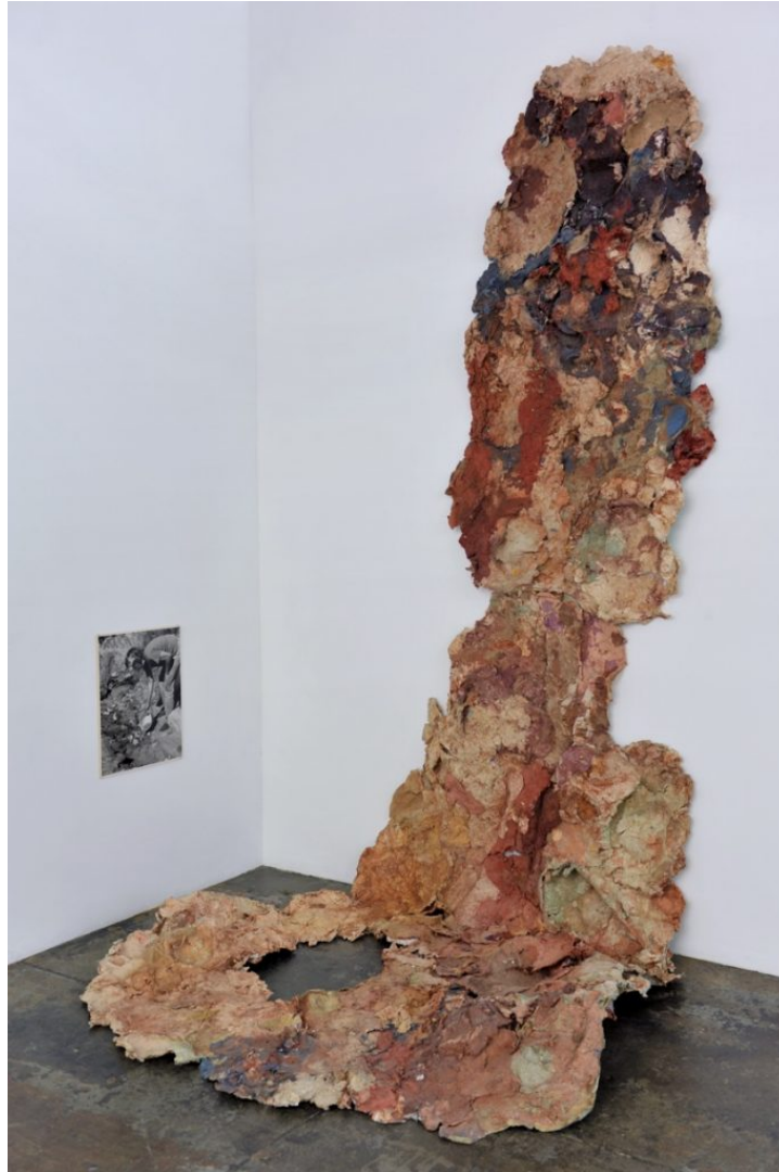
Betsy Damon, The Memory of Clean Water, 1985 (fragment of the 250ft installation, installation view, ecofeminism(s), Thomas Erben Gallery, New York 2020) ©Betsy Damon. Courtesy of the artist. (photo: Andreas Vesterlund)

This calm and meditative show illuminates a multitude of relating to all these complex issues. Rather than comparing the artworks we observe the positions they stand for. It reminds us once again that we as individuals and women chose our mode of relating to the Natural based on our subjective calls, but it is our responsibility to do so and voice these choices.